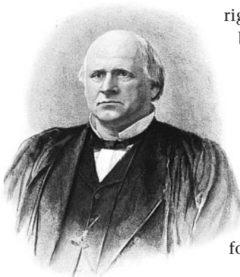
Justice John Marshall Harlan

He wrote, “In respect of civil rights, all citizens are equal before the law.” He condemned the majority for letting “the seeds of race hate . . . be planted under the sanction of law.” He also warned that “The thin disguise of ‘equal’ accommodations . . . will not mislead any one, nor atone for the wrong this day done.”