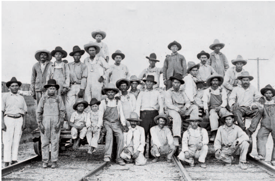
◀ Mexican track workers for the Southern Pacific railroad posed for this group photo taken sometime between 1910 and 1915.

Mexicans were accustomed to the region's hot, dry climate. But the work was grueling, and the railroads made them work for less money than other ethnic groups.