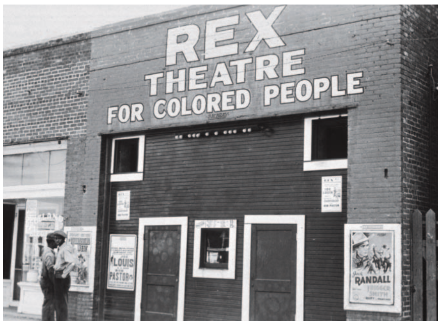
▲ This theater in Leland, Mississippi, was segregated under the Jim Crow laws.

PLESSY v. FERGUSON Eventually a legal case reached the U.S. Supreme Court to test the constitutionality of segregation. In 1896, in Plessy v. Ferguson , the Supreme Court ruled that the separation of races in public accommodations was legal and did not violate the Fourteenth Amendment. The decision established the doctrine of "separate but equal," which allowed states to maintain segregated facilities for blacks and whites as long as they provided equal service. The decision permitted legalized racial segregation for almost 60 years. (See Plessy v. Ferguson , page 290.)