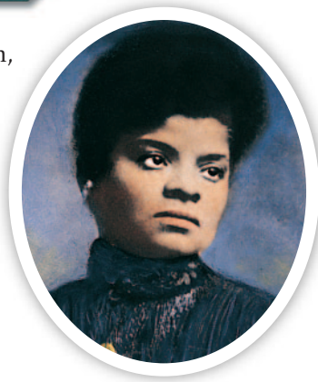
▲ Ida B. Wells wrote and lectured for civil rights.

African Americans were not the only group to experience violence and racial discrimination. Native Americans, Mexican residents, and Chinese immigrants also encountered bitter forms of oppression, particularly in the American West.