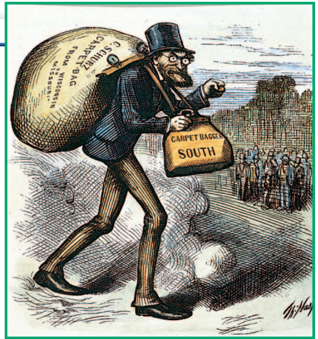
Image not available for use on this CD-ROM. Please refer to the image in the textbook.

The third and largest group of Southern Republicans—African Americans—gained voting rights as a result of the Fifteenth Amendment. During Reconstruction, African-American men registered to vote for the first time; nine out of ten of them supported the Republican Party. Although many former slaves could neither read nor write and were politically inexperienced, they were eager to exercise their voting rights.