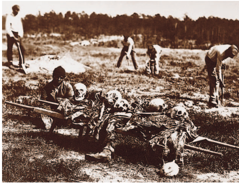
▲ Clearing battlefields of human remains was just one of the many tasks facing Reconstruction governments.

CONGRESSIONAL RECONSTRUCTION Angered by Johnson's actions, radical and moderate Republican factions decided to work together to shift the control of the Reconstruction process from the executive branch to the legislature. In mid-1866, they overrode the president's vetoes of the Civil Rights Act and Freedmen's Bureau Act. In addition, Congress drafted the Fourteenth Amendment , which prevented states from denying rights and privileges to any U.S. citizen, now defined as "all persons born or naturalized in the United States." This definition was expressly intended to overrule and nullify the Dred Scott decision.